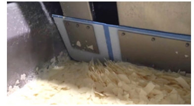
Coarse and fine filling