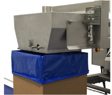
Filling straight into the box