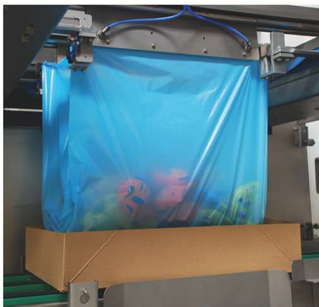
Ultim-11-S: Combine tray lining, filling and sealing.

Because of the combined filling and sealing unit and the very compact footprint, the machine can be integrated in almost any layout. Thanks to its special design the machine can easily be cleaned and hosed down daily.