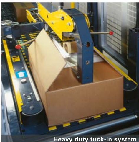
Heavy duty tuck-in system