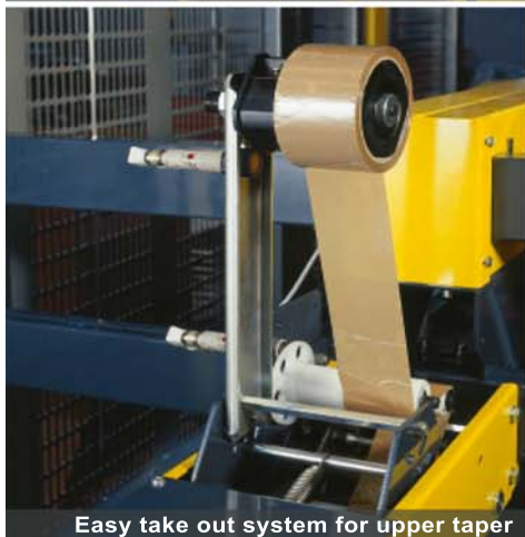
Easy take out system for upper taper