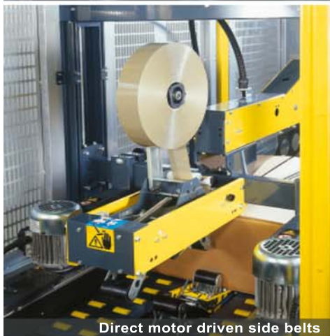
Direct motor driven side belts